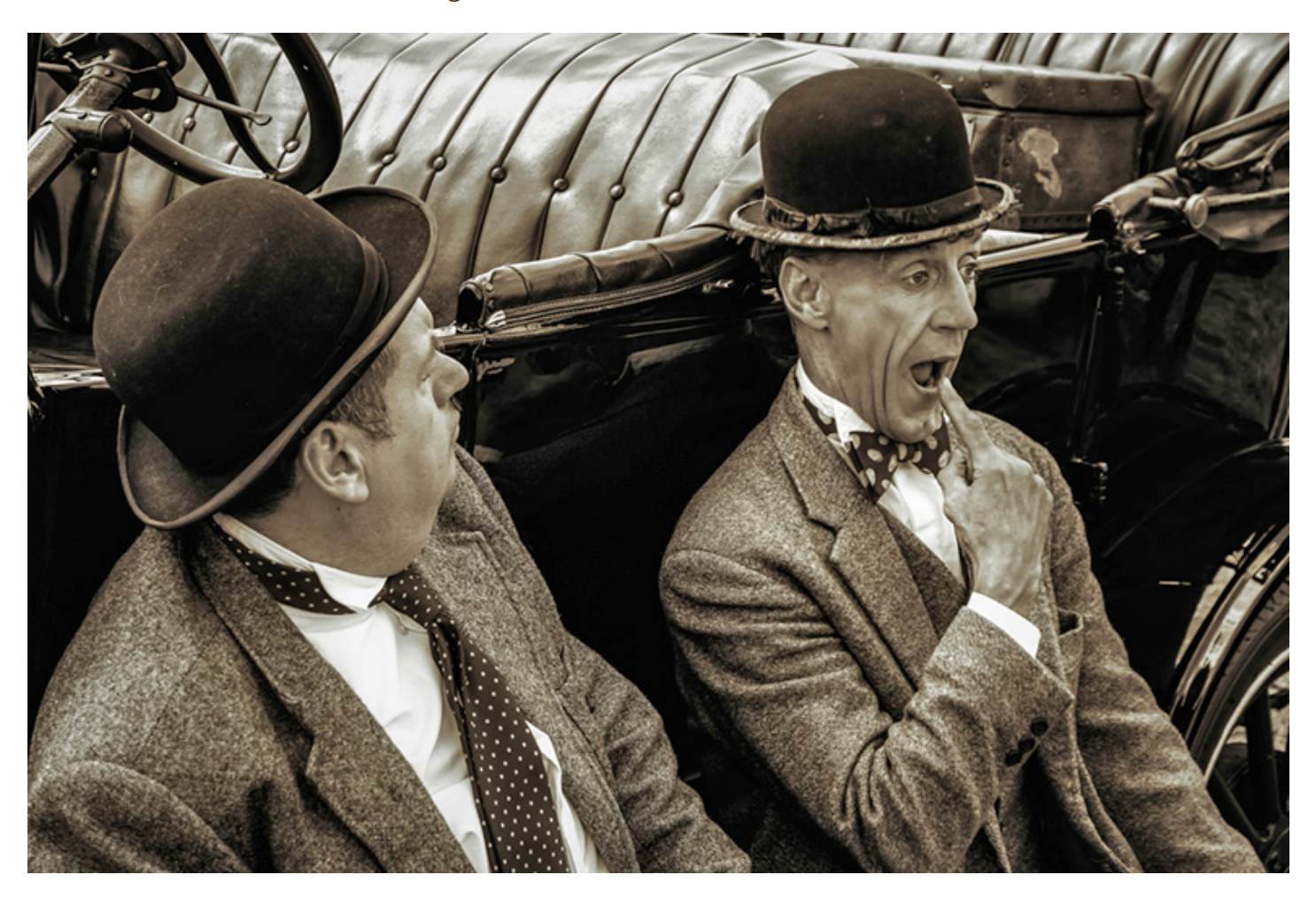
Laurel & Hardy lookalikes, Shoreham Airshow, 2014